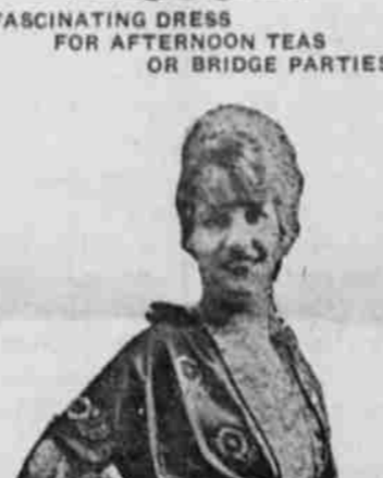
EMBROIDERED SATIN GOWN

You certainly know that it is a PART OF THEIR BUSINESS; that it PAYS THEM, PAYS US, PAYS YOU. Surely there are no cobwebs in your brain. Please laugh at foolish "critics" if you happen to stumble across any. This newspaper prints only what it believes to be HONEST ADVERTISEMENTS, accepted in GOOD FAITH from TRUST-WORTHY SOURCES.