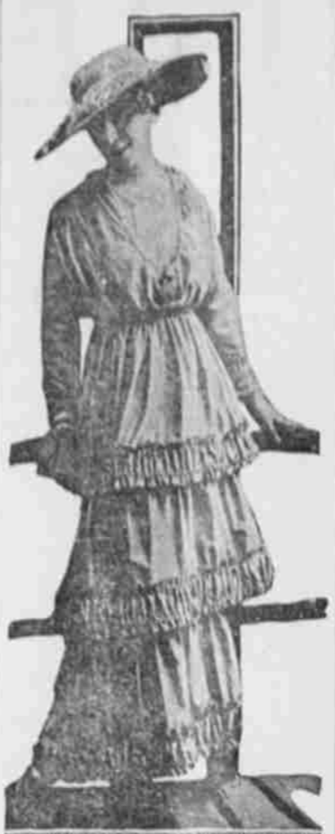
FLOUNCED FETE GOWN

This charming fete gown is carried out in supple lace tulle. The tiered skirt has ruchings of the silk applied to the edges of the flounces.