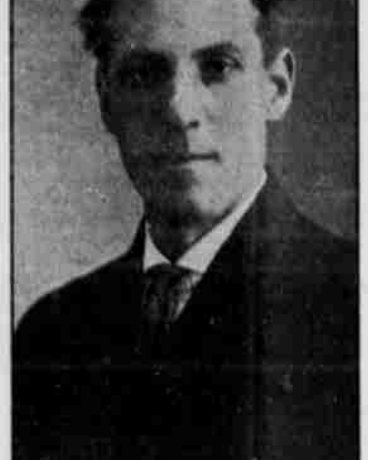
Republican candidate for nomination of REPRESENTATIVE