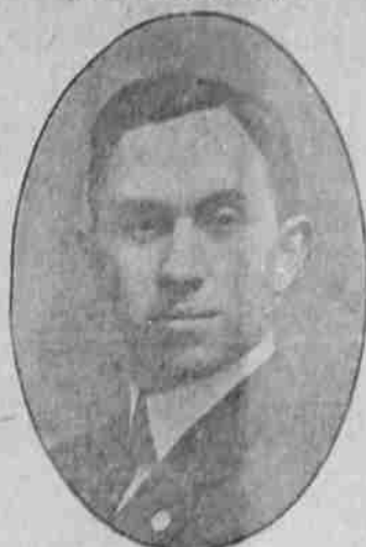
For Representative (Paid Advt.)