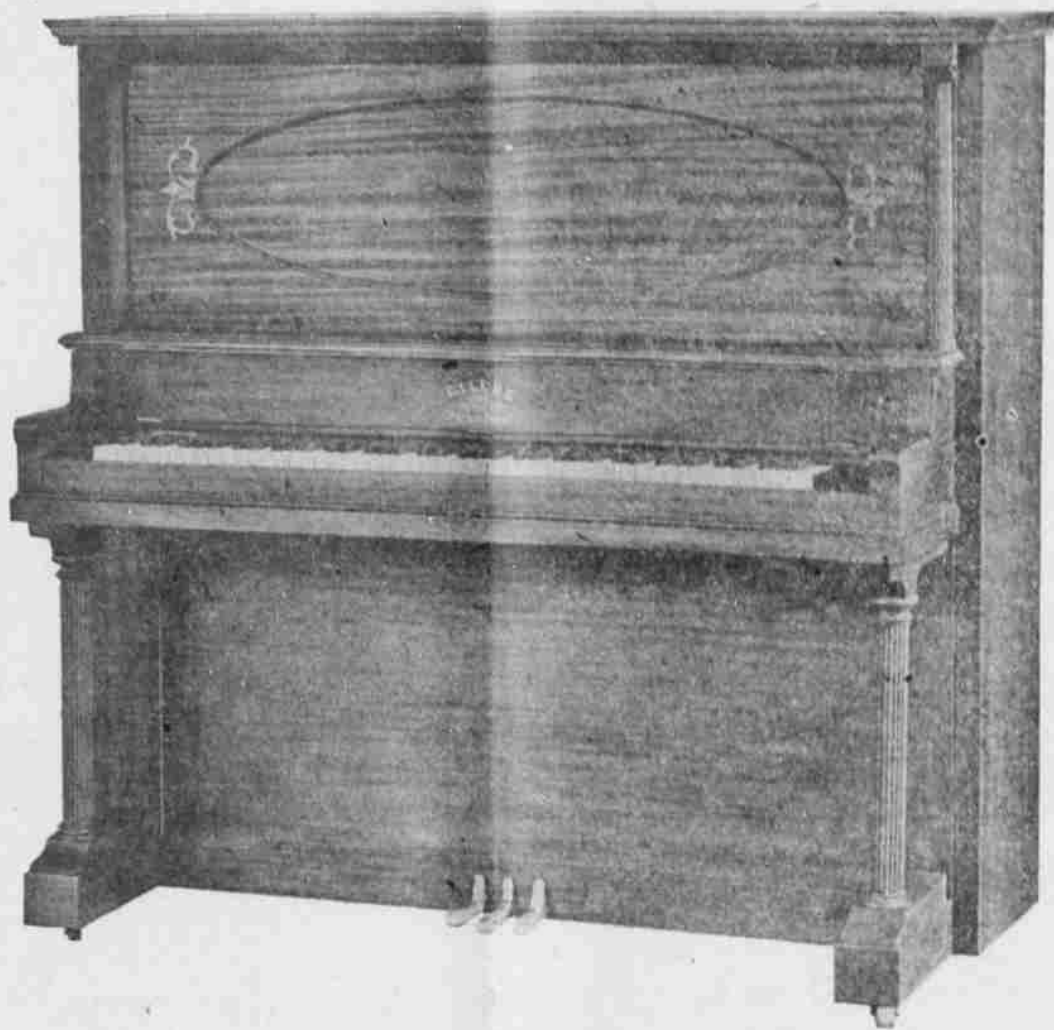
EILERS ORCHESTRAL UPRIGHT GRAND STYLE E. H. AWARDED GRAND HIGHEST PRIZE AT SEATTLE EXPOSITION.

Recently selected by the Portland Commercial Club, after a most exhaustive test of various makes. It is a Western Piano, made to withstand Western climatic conditions. Finished in choicest of mahogany, figured walnut and quarter-sawn oak, in bright, or French, or dull finish. This piano will be awarded to the contestant having the highest number of votes in the contest, without reference to districts.