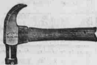
Full Sizes 15c

There are numerous small articles used about the house that you do without because you do not need them often enough to feel like putting much money in them. A 16-cent hammer will serve all the purposes of one you pay $1 for. It will not stand the hard constant usage a carpenter will require, but it is good enough for occasional use.