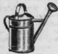
Watering Pots 35 Cents