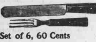
Set of 6, 60 Cents

we expect to get it on the close price and good goods plan.