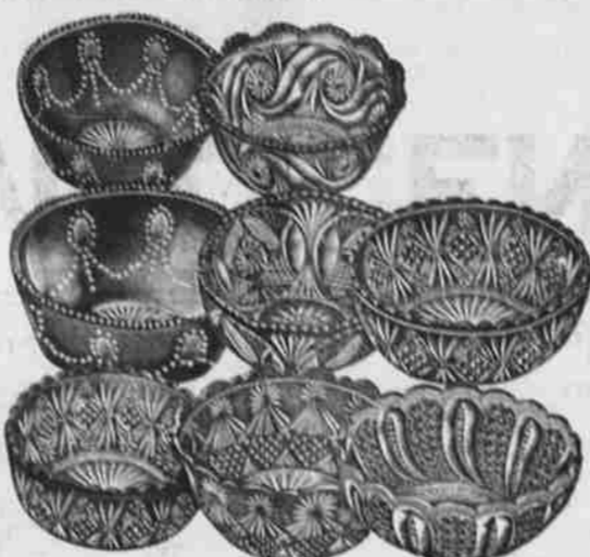
Large Berry Bowls 15 Cents

Handsome Ornamental Globes complete with Wick, Burner and Globe.