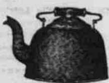
Tea Kettle 65c