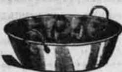
14 Quarts, 45 cents