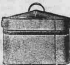
Copper Bottom, $1.20