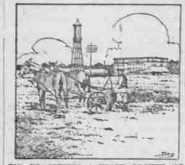
FIG. XI-CUTTING & HEAVY GROWTH OF ALFALFA.

Where the soll is builty lacking in Cowpens and soy beaus are to the nitrogen and humus it sometimes pays southern part of the United States to plaw under the entire crop of clover, what clover and alfalfa are to the The nitrogen which leguminous northern sections. They are grown plants add to the soil is by no means more as hay and forage than for the their use. Nearly all of them have a some sections of the corn belt as catch long taproot, which forces its way crops. If sown on early fall plowing, down into the soil far below the depth they prevent the soil from washing