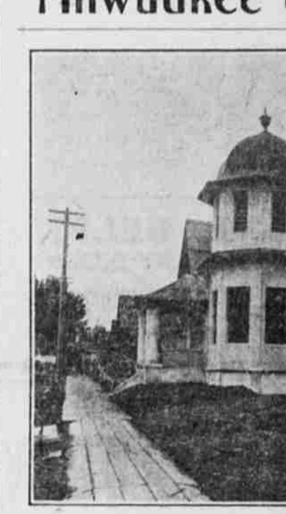
EMANUEL EVANGELICAL CHURCH.