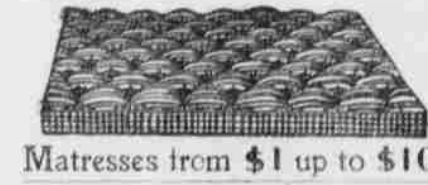
Mattresses from $1 up to $10