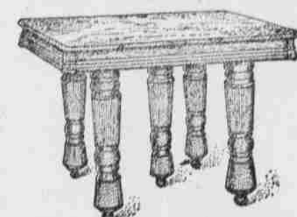
Dining Tables, fine assortment from $3 to $10