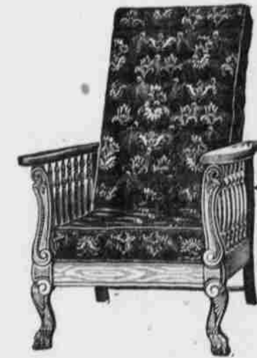
Morris Chair Elegant Xmas Gift

A few samples of our Furniture Values. We can save you money on any order. Let us prove it.