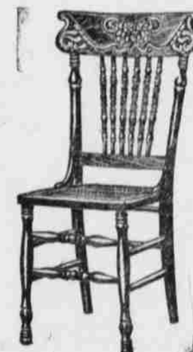
Dining Chairs from 75c to $1.65 for fine ones