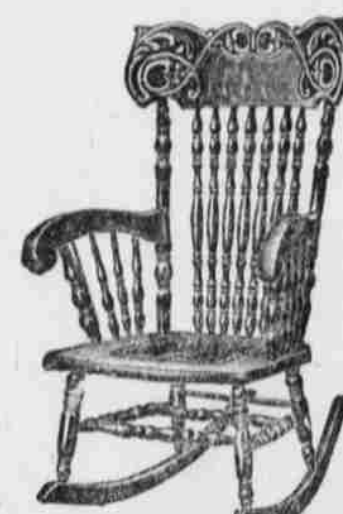
Rockers, a nice line to suit everyone, $1 up to $7.50