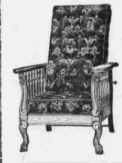
Morris Chair Elegant Xmas Gift