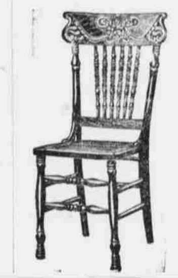
Dining Chairs from 75c to $1.65 for fine ones everyone. $1 up to $7.50