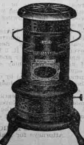
Coal oil Heaters from $3.35 to $6.00