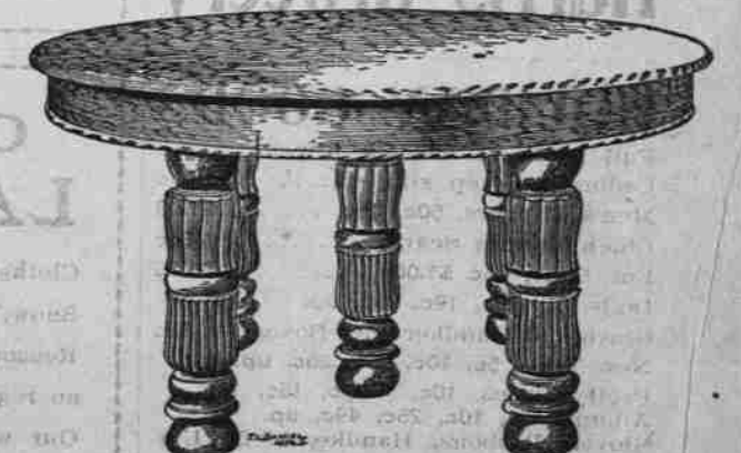
Extension Tables, round and square, $12.50; regular $16.00 value.