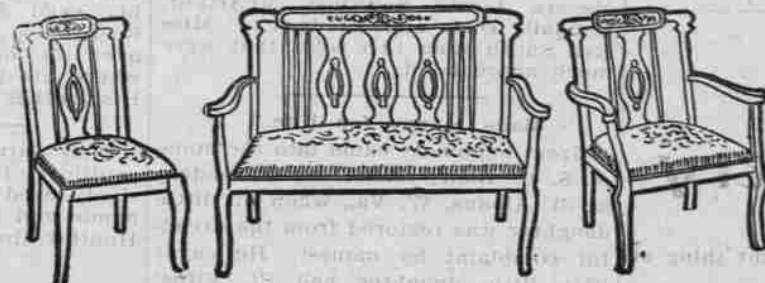
3 piece Parlor Suit $20.00.