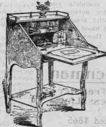
Ladies' Writing Desks from $5 to $20