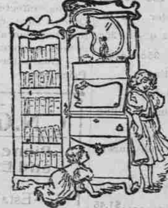
Comb. Book Cases from $12.50 to $40.