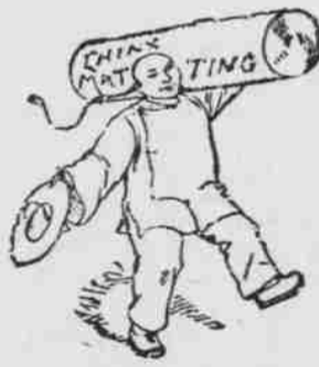
MATTING 15c per yard.