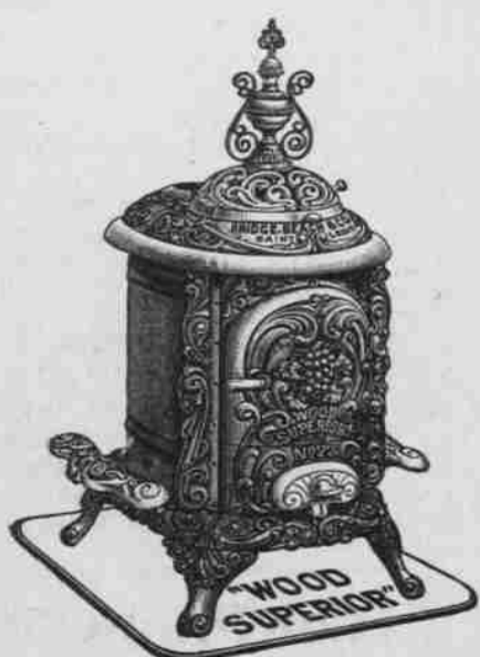
Best quality Heating Stove; not a cheap one, but the best that money can buy. Price $15.00

We have some nice wall paper for 10c, double rolls.