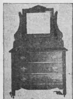
FANCY BUREAU Full size, swell top drawers, well made, elegant golden-oak finish, mirror 18x24. Price $7.75.

With those objects in view, always by adhering strictly to them, we've been enabled to increase our business daily—until today we stand second to none—thanks to an appreciative public.