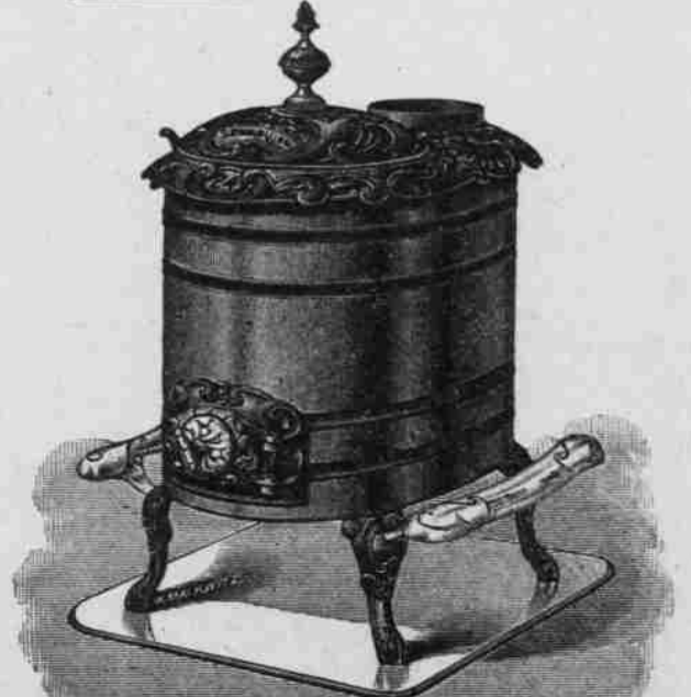
This Air Tight Heater $5.75.