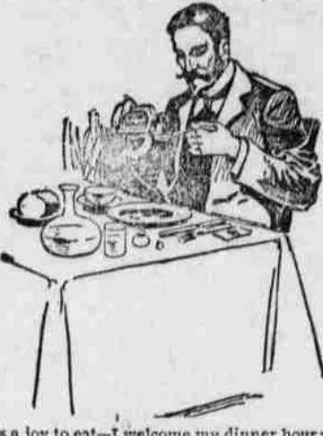
'Tis a joy to eat—I welcome my dinner hour; Because I root in digestion with August Flower!

Constipation is the result of indigestion, biliousness, flatulency, loss of appetite, self-poisoning, anemia, emaciation, uric acid, neuralgia in various parts of the system, catarrhal inflammation of the intestinal canal and numerous other ailments that rob life of its pleasures if they do not finally rob you of life itself.