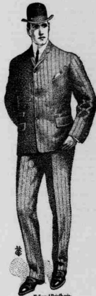
Friend Brothers Clothing Co.