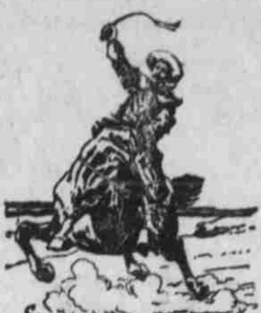
A RACE FOR LIFE.