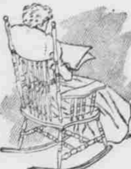
This elegant cotter seat rocker, regular value $2.75 Now $1.50

The cleanest and purest of all. The general health depends a great deal on how we sleep. In order to be able to do a good day's work we must be freshened up by a good night's rest on a comfortable mattress. A good mattress means good sleep and good health. Cotton Felt Mattresses that are sold for $14.00 can be bought here for $12.00 higher grade ones for $15.00 and $16.00. We have others made of different material as cheap as $2.50.