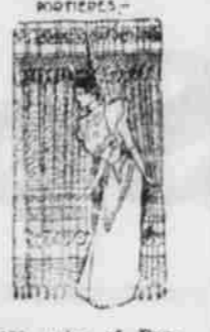
120 pairs of Portiers. No reasonable offer rejected.