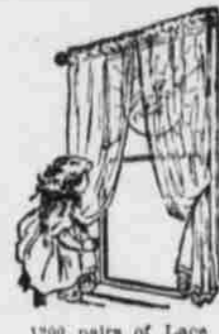
1200 pairs of Lace Curtains. No reasonable offer rejected.