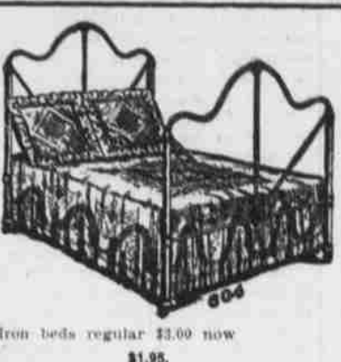
Iron beds regular $3.00 now $1.95.

To make room for our Furniture Factory output we are compelled to clean out large spaces, occupied now by other merchandise. In order to make these goods move quick, we will sell them at prices never offered before, quality considered, in any part of this western country. Credit sales will only be made on well secured notes with 6 per cent interest.