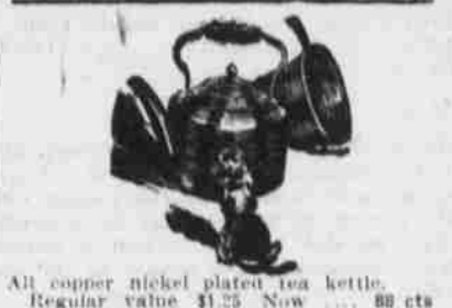
All copper nickel plated tea kettle. Regular value $1.25 Now 80 cts.

Yum Yum Woven Wire Springs, hardwood frames, best in the market, regular $1.50 value, now, as long as stock lasts. $1.95.