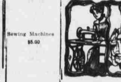
Sewing Machines $5.00