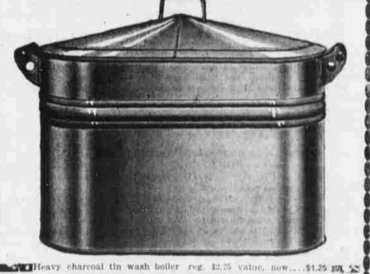
Heavy charcoal tin wash boiler reg. $2.25 value, now... $1.25

Air tight heater, latest improvements, stands 2 ft. 6 inches high, $4.00 value, now $2.50