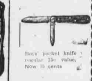
Two pocket knife regular 25c value. Now 15 cents

All Furniture sold at Manufacturers' Prices. All Crockery sold at Cost