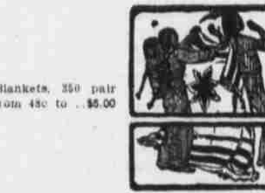
Blankets, 350 pair from 45c to $.50