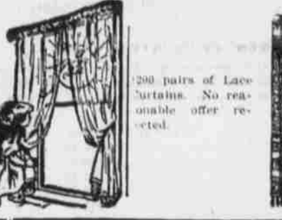
200 pairs of Lace Curtains. No reasonable offer rejected.