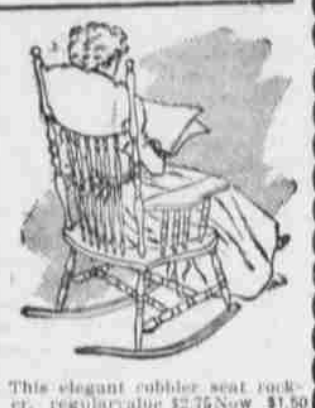
This elegant rubber seat rocker, regular value $2.75 Now $1.50.