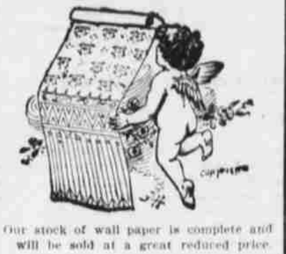
Our stock of wall paper is complete and will be sold at a great reduced price.

2000 DOORS—Contractors and builders, please note prices: Well seasoned and well put up cedar doors, 1 1/2-3 in. thick, 2 feet 8 in. x 6 feet 8 in. 4 panels, regular value $1.85, now $1.35 5 cross panel doors, 2 feet 6 in. x 6 feet 6 in. x 1 1/2 in., regular $1.75 value, now $1.25. Front doors and windows in proportion. Screen doors.....90c