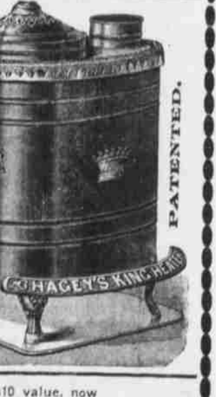
Regular $10 value, now $7.00

Air tight heater, latest improvements, stands 2 ft. 6 inches high, $4.00 value, now $2.50