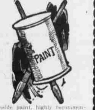
Inside paint, highly recommended. $1.50 value per gal. $1.25