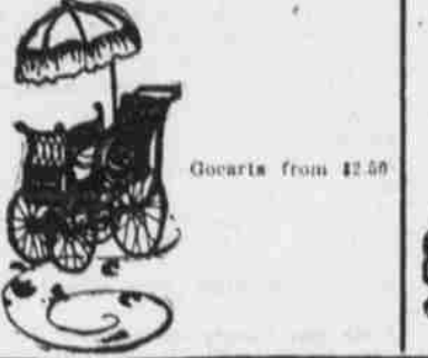
Goatsies from $2.50