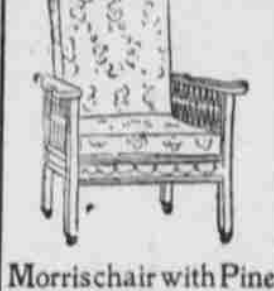
needle fibre cushions $6.50.