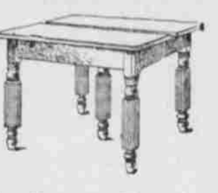
6 foot Extension Tables from $4.00 up