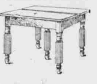
6 foot Extension Tables from $4.00 up