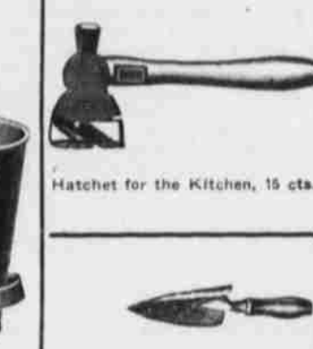
Heavy Garden Trowel, 10 cts