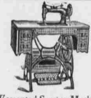
Warranted Sewing Machine $15.00