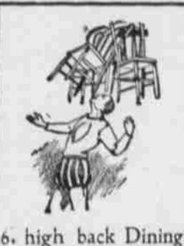
chairs, all hardwood $3.85.

This hardwood rocker Cobbler seat $1.75.