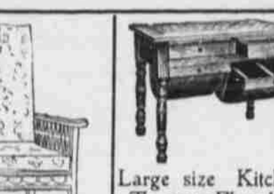
Morrischair with Pine needle fibre cushions