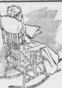
This hardwood rocker Cobbler seat $1.75.

isn't always the man who saves money. There are two ways of saving your money: one is by putting it in a bank—after you get it; the other is to buy where you get the greatest values for it. In dealing with us you will save money by the second method, and so by the first method, too.