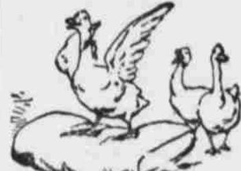
Pillows $1.00 per pair