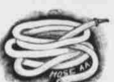
50 feet Rubber Hose