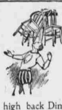
6 high back Dining chairs, all hardwood $3.85.