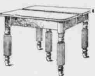
6 foot Extension Tables from $4.00 up