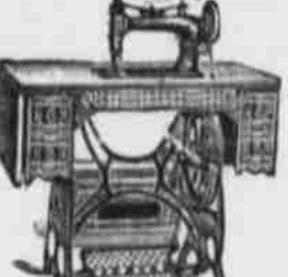
Warranted Sewing Machine $15.00