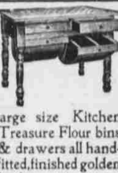
Large size Kitchen Treasure Flour bins & drawers all hand- fitted, finished golden fir, fancy trimmings, $3.50. Others for $2.50.