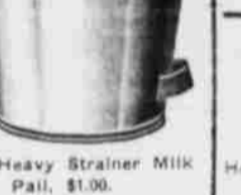
Extra Heavy Strainer Milk Pail, $1.00.