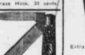
Grass Hook, 30 cents.