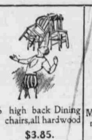
6 high back Dining chairs, all hardwood $3.85.