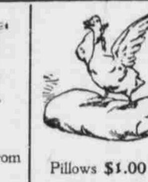
Pillows $1.00 per pair