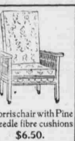
Morris chair with Pine needle fibre cushions $6.50.