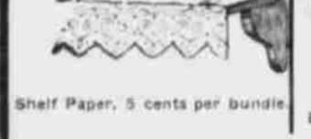
Shelf Paper, 5 cents per bundle.