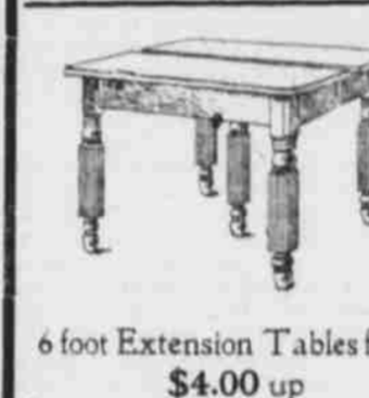
6 foot Extension Tables from $4.00 up