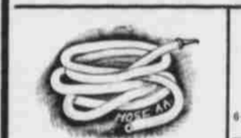
50 feet Rubber Hose, $3.00.