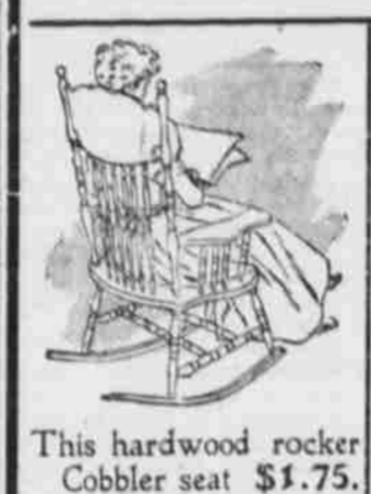
This hardwood rocker Cobbler seat $1.75.

isn't always the man who saves money. There are two ways of saving your money: one is by putting it in a bank—after you get it; the other is to buy where you get the greatest values for it. In dealing with us you will save money by the second method, and so by the first method, too.