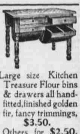
Large size Kitchen Treasure Flour bins & drawers all hand-fitted, finished golden fir, fancy trimmings, $3.50. Others for $2.50.