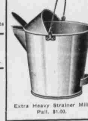
Extra Heavy Strainer Milk