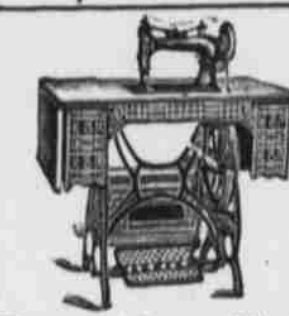
Warranted Sewing Machine $15.00