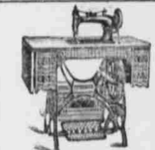
Warranted Sewing Machine $15.00