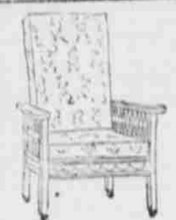
6 high back Dining Morrischair with Pine needle fibre cushions $6.50.