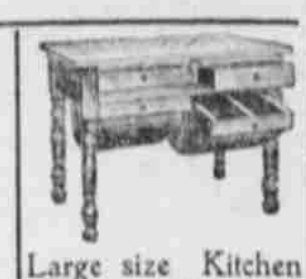
Treasure Flour bins & drawers all handfitted,finished golden fir, fancy trimmings, $3.50. Others for $2.50.