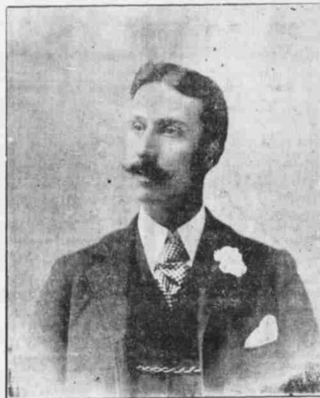
Republican Nominee for Recorder.