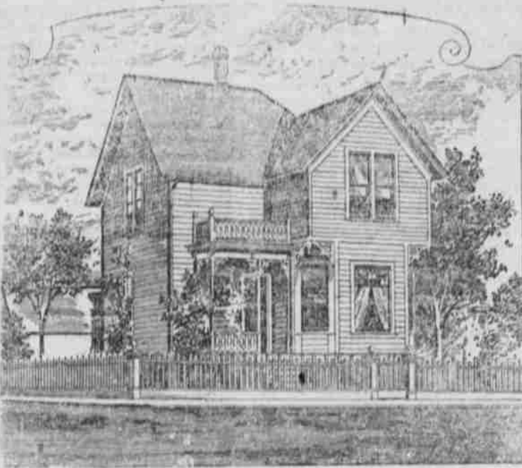
First Residence Built in Gladstone, 1893.

Never has the stability of Real Estate been more forcibly emphasized than by the sharp contrast of values which these market convulsions reveal: over against the purely speculative, fluctuating and fictitious, stands Real Estate, solid, substantial—a very Gibraltar of stability—the most pronounced example of a commodity unaffected by the gusty winds of Wall Street or the unscrupulous manipulations of overcapitalized jugglers.