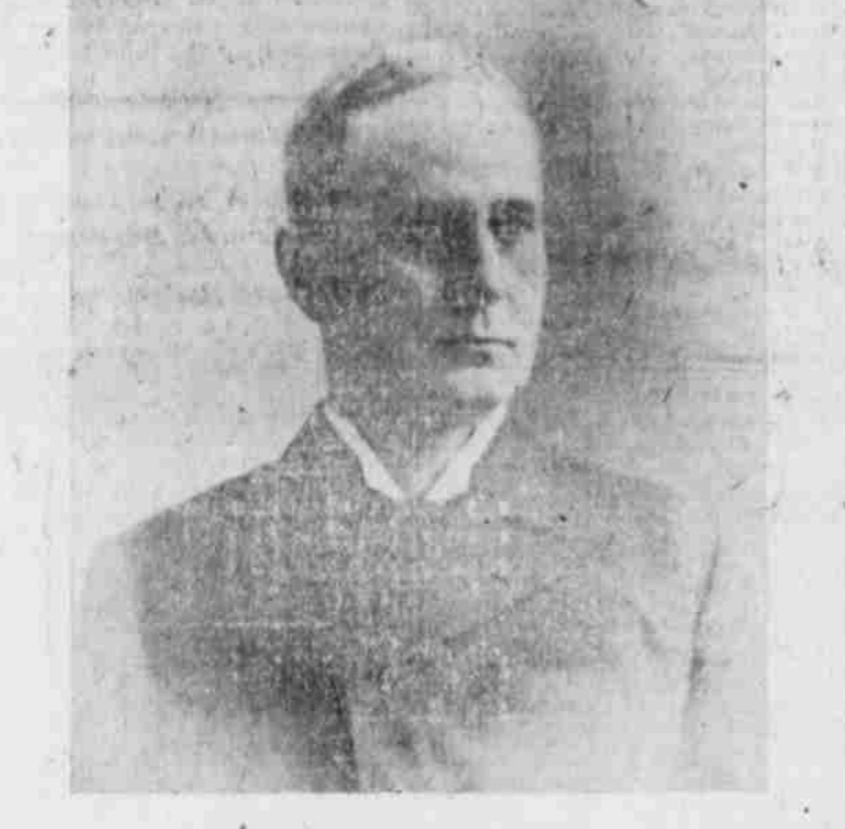
CONGRESSMAN CHAMP CLARK.