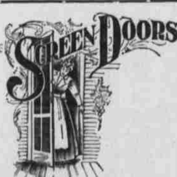
We have them, also window screensvery cheap this season.

long. That's economical. We'll sell you the kind you want, but advise the best.