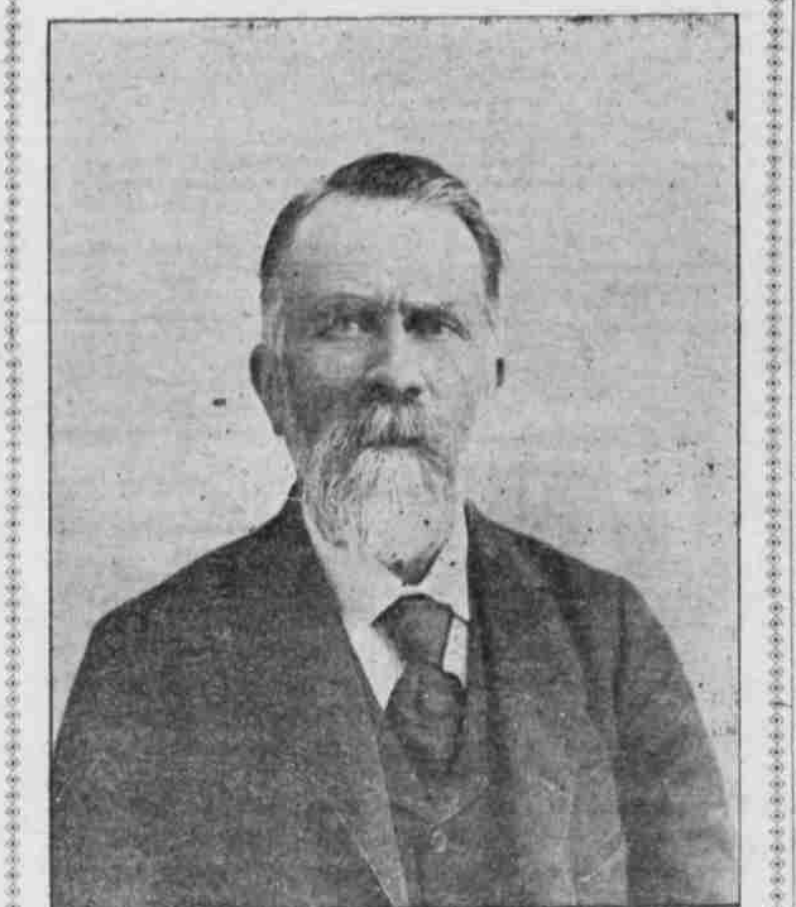
REPRESENTATIVE of this County in the Legislature convening next Monday at Salem.