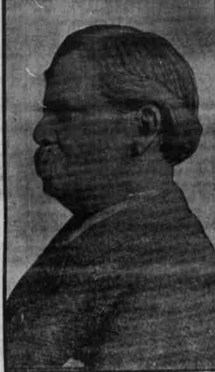
HON. HENRY WATTERSON.