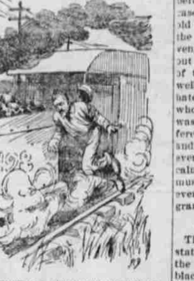
I TURNED AND SPRANG FROM THE CAB.