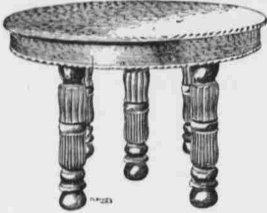
This Round Oak Table $12.50

This silverware is not of the grade usually offered. This is better than the other—it's the very best you can get. It is heavily plated, and will wear and look well for many years. Several distinct novelties are shown in spoon patterns. Buy now for Christmas giving.