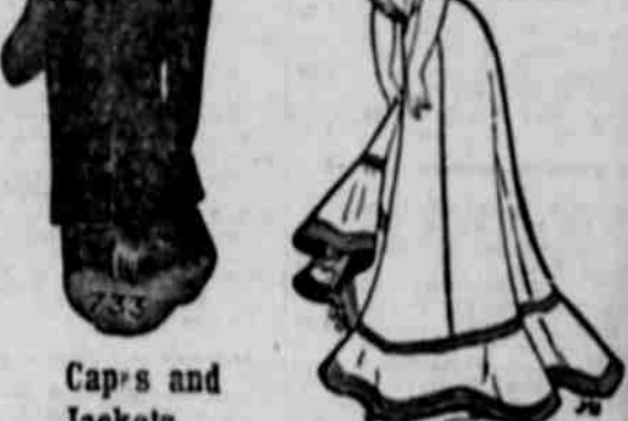
Cap's and Jackets

Women's Walking Skirts Women's Tailor Made Dress Skirts. We carry a complete line.