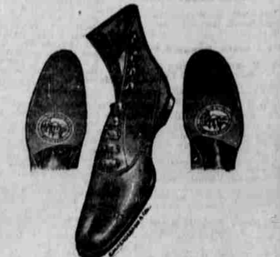
Our Fall and Winter stock comprises Dry Goods, Clothing, Boots, Shoes, Hats, Caps, Furnishing Goods, Notions, Ladies' Jackets, Capes, Etc.

Women's Goat Button 9c Women's Dongola Lace, patent tips, $1 Women's Dongola Kid lace, selected stock, $1.50 Women's Vic Kid lace, flexible, McKay, stock, $2 Women's Fine Soft Kid, flexible, McKay, $2.50, $3, $3.50, $4.00 Women's Kangaroo Calf, in lace or button, thoroughly well made shoe, built to give extra good wear, $1.75 Men's Genuine Sain Calf, half-mold leather outer and inner sole and counter, $1.50 Men's Plow Shoes, tan sole, seamless back, warranted solid through-out, $1.50 In Children's and Misses' Shoes we are agents for the "Red School House Shoe," warranted to give perfect satisfaction, every pair guaranteed, a good wearer, prices from $1.25 to $2 Men's Split Boots, tap sole, saddle seam $1.75 Men's Calf Boots, $2, 2.50, $3 Men's Kip Boots, $3 Men's Buckle Shoe, $1 Men's Dress Shoes, $2 Men's Dress Shoes, the L. A. Crossitt.—We are Oregon City agents. Represents the very highest quality, price $2.00 $3, $3.50