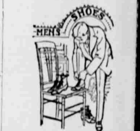
Table Cloth. Shoes.

Ladies' Dongola lace. . . . .$1.00 Ladies' Dongola lace, solid throughout stock tip. . . . .$1.50 Ladies' Vici, lace or button. . . . .$2.00 Ladies' Vici, lace. . . . .$2, $3 and $3.50 Ladies' Oxfords. . . . .75c, $2, $1.25 and $1.50 Men's plow shoes, tap soles. . . . .$1.50 Men's genuine satin calf bala or congress solid leather outer and inner soles. . . . .$1.50 Men's tan shoes. . . . .$1.50 Men's Dongola shoes. . . . .$1.50 Men's dress shoes. We are agents for the Lewis A. Crosssett. We claim for these shoes all the service that can be found in any shoe at any price. Price . . . . .$2.50, $3 00, $3 50 and $4 00