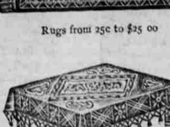
Table Scarfs all sizes and prices

Nice Framed Pictures with 16x20 glass, $1.25