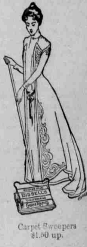
Carpet Sweepers $1.50 up.