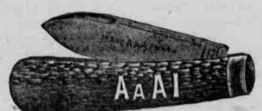
Warranted Pocket Knives 70 cents.