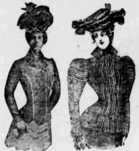
— we have a representative line of fashionable garments.