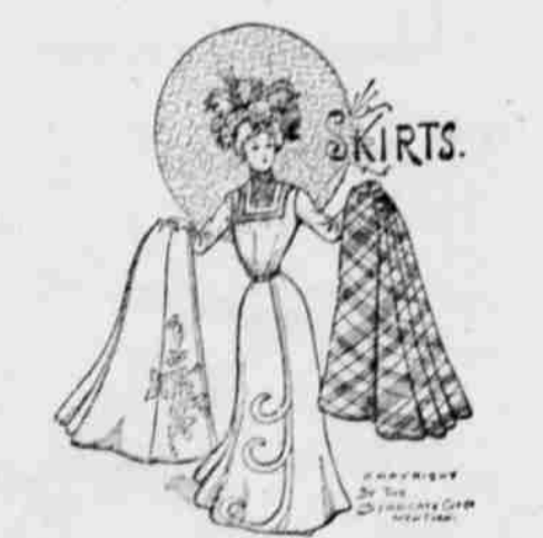
extremely low, considering the high-grade line we are offering.