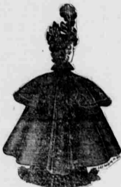
Ladies' plush capes. $2 00 upward