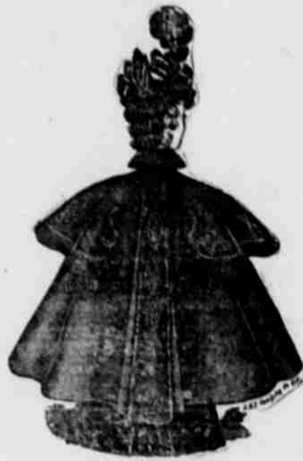
Ladies' plush capes, $2 00 upward