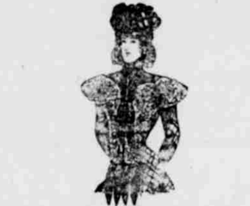
Ladies' Plush capes, novelties, ranging up to $15 00