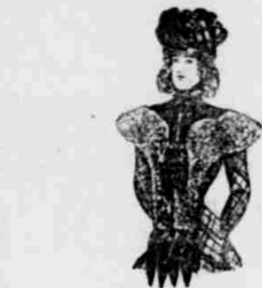
Ladies' Plush capes, novelties... ranging up to $15 00