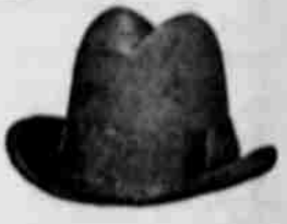
Men's fedora fur hats, satin lined. $1.50