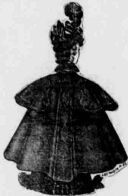
Ladies' plush capes. $2 00 upward