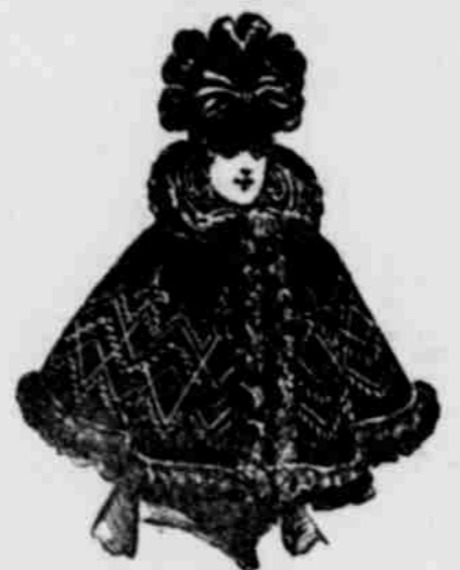
Ladies Golf capes. Ladies' Boucle capes.