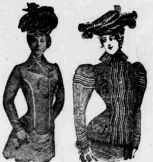
— we have a representative line of fashionable garments.