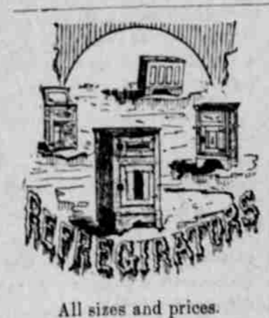
All sizes and prices.

Housefurnishing Summer Needs. If you are interested in securing these items at lowest possible prices, you'll thoroughly appreciate our June offerings, you'll feel them to possess exceptional merit. It's passing along to our customers the houseneeds at their real worth, it's in giving honest values that makes this store a favorite buying place.