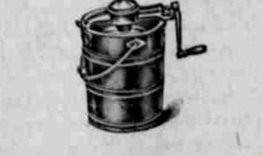
Ice Cream Freezers to rent.