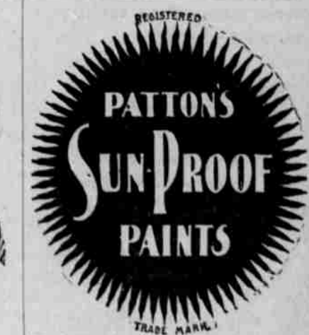
We keep a full stock of Paints, Oil and Glass and would like to give estimates of cost to our customers contemplating painting their houses.