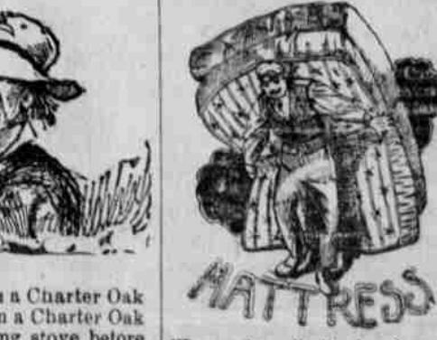
We make all kinds of mattresses from $1.90 np

This tramp can tell the difference between bread baked in a Charter Oak Stove or any other kind of stove. The crust of bread baked in a Charter Oak Stove will never be hard. Caution your friends not to buy a cooking stove before they have examined into the merits of Charter Oak Stoves.