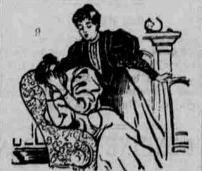
Love that Alters.