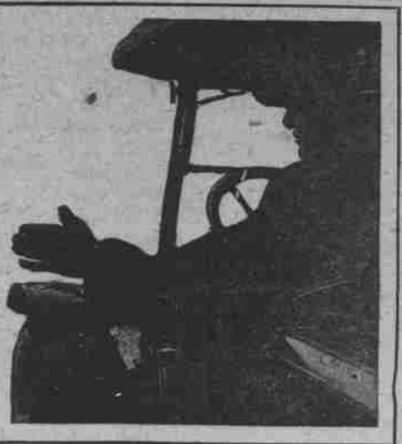
STOP —To signal your intention to stop, extend arm straight out with back of hand to rear of car