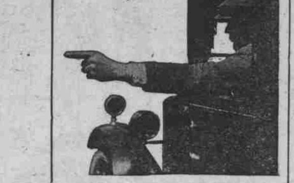
LEFT TURN —To signal your intention to turn to the left, extend the arm and point finger to the left

The signals are published here through the courtesy of the Pacific Highway Garage.