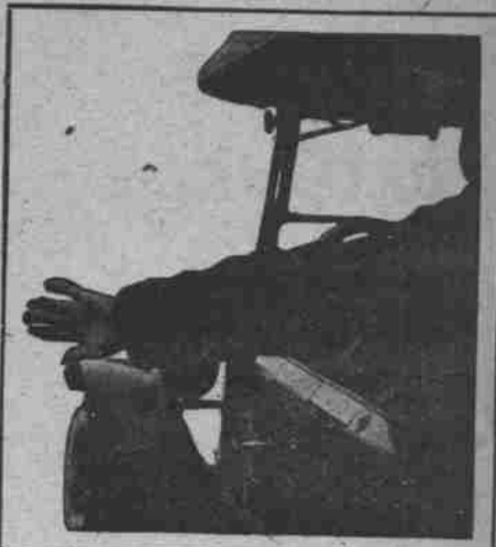
BACK UP —First look back to see if the way is clear. Then extend arm with palm of hand to the rear and motion backward