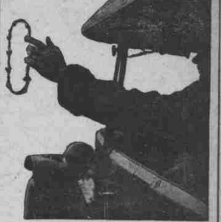
TURN AROUND —To signal your intention to turn completely around, circle arm and hand three times backward

Chap. 118, General Laws of Oregon, for 1921, that a Road District Meeting of the legal voters of Road District No. 24, Clackamas County, Oregon, will be held on the 18th day of November, 1922, in said road district at the hour of 8:00 P. M. in the AILMES, NEAR BULL RUN, to vote an additional tax in said Road District for road purposes as by Law provided.