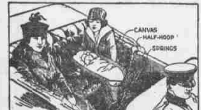
The Baby is Thoroughly Comfortable on Dolly Auto Always When Resting in the Hammock.

Six screen-door springs, a barrel hoop, and a yard of heavy cloth were the materials necessary to make a baby's hammock for the auto coach, which gives useful service and comfort. The hammock takes the place of the third person in the rear seat, as shown. It can be quickly attached or detached, and swings baby safe from jolting. The hoop was from a barrel, 16 inches in diameter, and was cut in half, each half holding one end of the hammock. These half hoops were held 80 inches apart by means of heavy