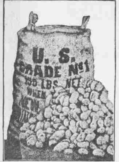
This Sack, Labeled "U. S. Grade No. 1," Contained Run Stock Shown in the Foreground.

Sixty per cent of the commercial potato crop in the United States is now bought and sold upon the basis of United States potato grades, according to the bureau of markets and crop estimates, United States Department of Agriculture, and every producer contributing to that quality of graded stock is vitally concerned with the elimination of dishonest grading practices. Growers and shippers whose honesty cannot be relied upon soon find