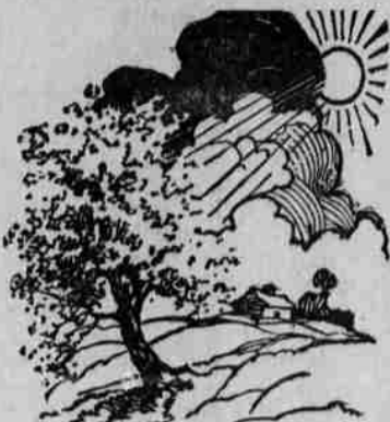
AFTER CLOUDS COMES SUNSHINE. AFTER DEPENDENCY COMES JOY. AFTER SICKNESS COMES HEALTH. AFTER WEAKNESS COMES STRENGTH.

In the spring when you're "all in"—fagged out—blood thin, if you will turn to Nature's remedy, a tonic made from wild roots and barks, which has stood fifty years as the best spring tonic—you will find strength regained. No need to tell you it's Dr. Pierce's Golden Medical Discovery, put up in tablet or liquid form, and sold by every druggist in the land. After a hard winter—shut up indoors, your blood needs a temperance tonic, a tissue-builder and blood-makersuch as this "Medical Discovery" of Dr. Pierce's.