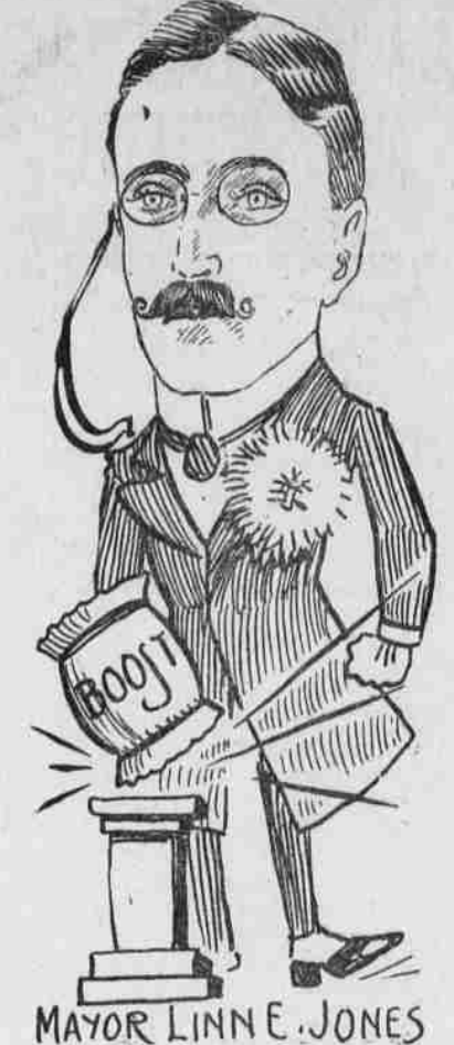
MAYOR LINN E. JONES