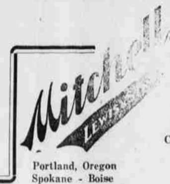
Portland, Oregon Spokane - Boise

If you want to know how much the silo filler will do for you, send in the coupon for this book. State the size of your silo, and we will quote you. It places you under no obligation to buy.