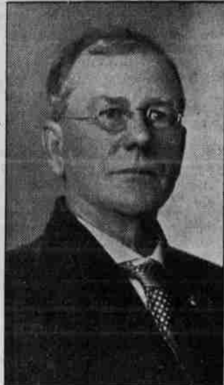
Democratic Candidate for Sheriff of Clackamas County

WHAT BACKING A NEWS-PAPER WILL ACCOMPLISH