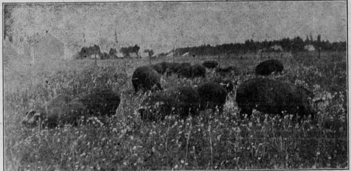
Pigs in Clover at The Dimick Stock Farm

blood Poland China swine the feed question has been given careful consideration, with the idea in view of producing swine at the least possible cost. This work has been carried on in a business way and it has been found that swine can be raised and fattened for market at a very low cost.