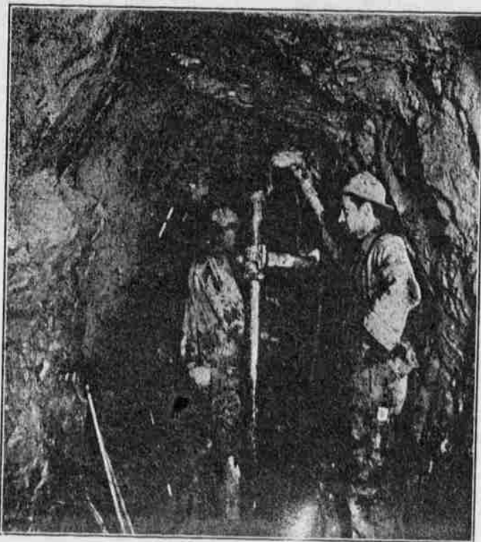
Operating Pneumatic Drill in Tunnel

Probably over half of the stockholders of Clackamas county have a personal knowledge of the mine. Singly, by pairs and in parties they have made the long, hard trip over the mountains; have had their own assays made from the specimens they themselves have taken from the drifts, and these men have an abiding faith that Ogle mine will make more than good.