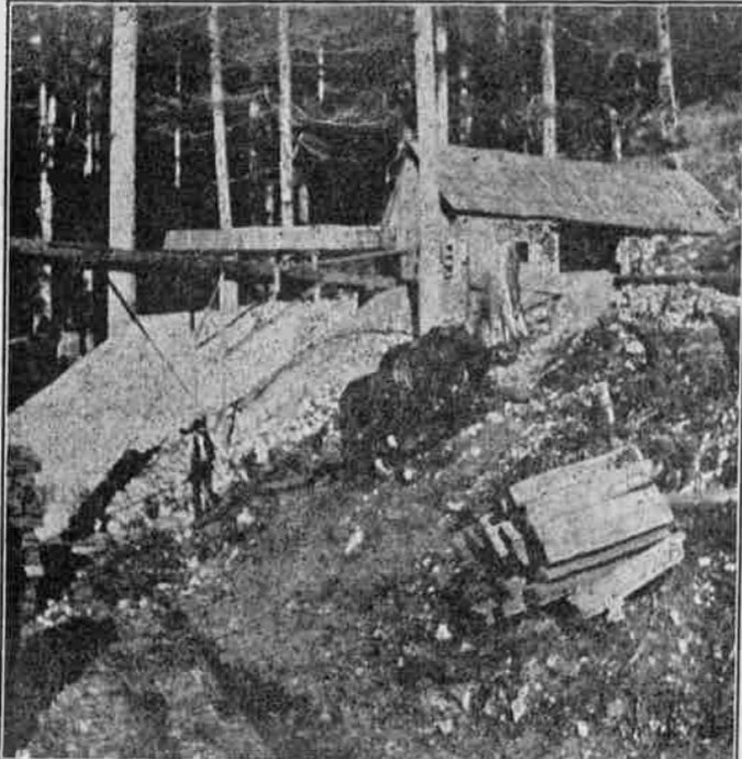
Entrance to Mines on Ogle Mountain.—Buildings Over Shaft.

And when Ogle makes good, there is little doubt but many other claims in that vicinity, which have been held for years, will follow in development