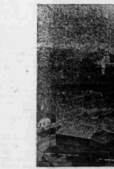
Aeroplane View of Oregon City, Showing River and Suspension Bridge